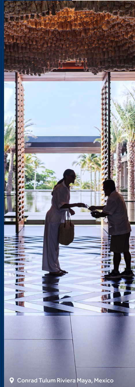
📍 Conrad Tulum Riviera Maya, Mexico

IR Magazine Best ESG Reporting Large Cap